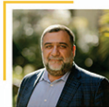
Ruben Vardanyan IDeA Foundation, Aurora Humanitarian Initiative